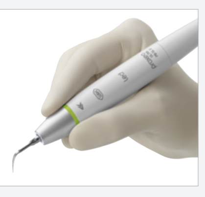
Handy and comfortable The shape of the handpiece and its light weight ensure maximum comfort.