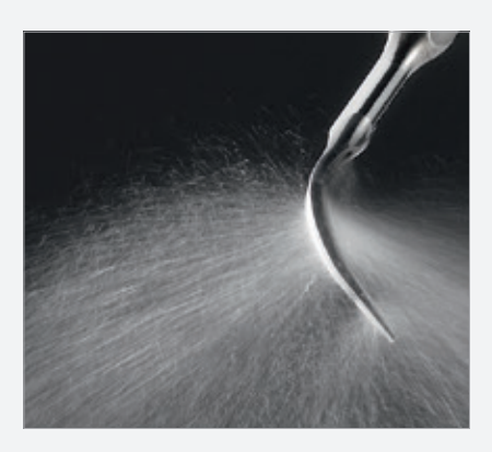
Treatment site always cooled The integrated spray ensures constant and effective cooling of the treatment site.